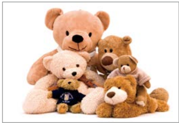
■ Stuffed toys