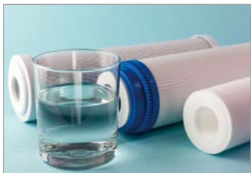
■ Water purifier filter