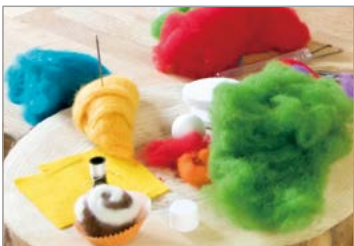
■ Nonwoven fabric